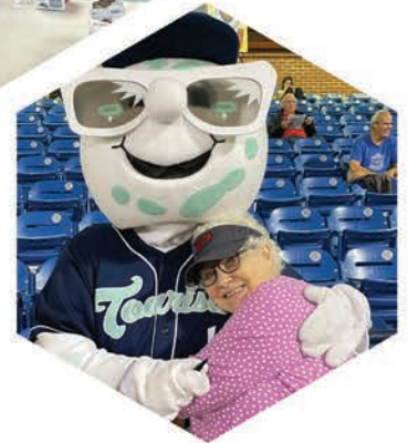
Senior field trip to the ballpark!