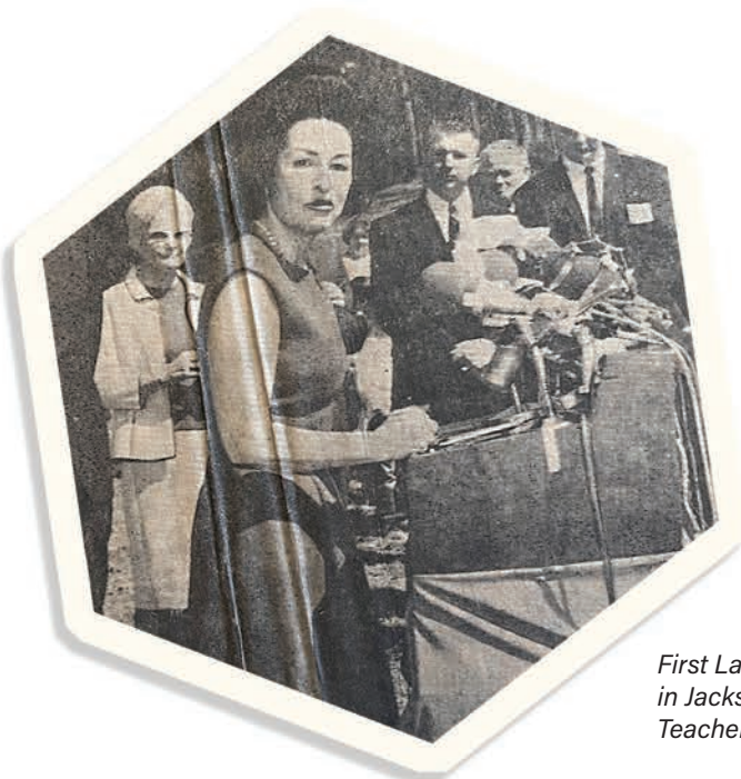
First Lady Ladybird Johnson speaks at Little Canada/Sols Creek Consolidated School in Jackson County on March 12, 1967. She traveled here in support of the National Teachers Corps project, which was administered locally by Mountain Projects.

At Mountain Projects, we believe that each of our clients deserves to live in a safe physical environment, and we work each day to help meet that need. Our programs are designed to improve the social, economic, educational, emotional and health of our clients.