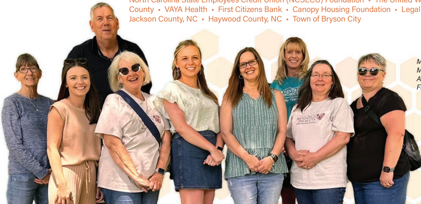
Members of the Mountain Projects Administrative and Finance teams

Community Foundation of WNC ▪ Dogwood Health Trust ▪ Duke Energy ▪ Evergreen Foundation Great Smokies Health Foundation ▪ Haywood Health Foundation ▪ Kate B. Reynolds Charitable Trust North Carolina State Employees Credit Union (NCSECU) Foundation ▪ The United Way of Haywood County ▪ VAYA Health ▪ First Citizens Bank ▪ Canopy Housing Foundation ▪ Legal Aid of NC ▪ Jackson County, NC ▪ Haywood County, NC ▪ Town of Bryson City