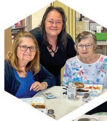
Congregate nutrition seniors at lunch

The SRC was a sponsor and attended the Haywood County Senior Games opening and closing events. On June 17th the Haywood Co. Elder Abuse Awareness Walk was held at Lake Junaluska, in partnership with DHHS and the Haywood County Sheriff's Office.