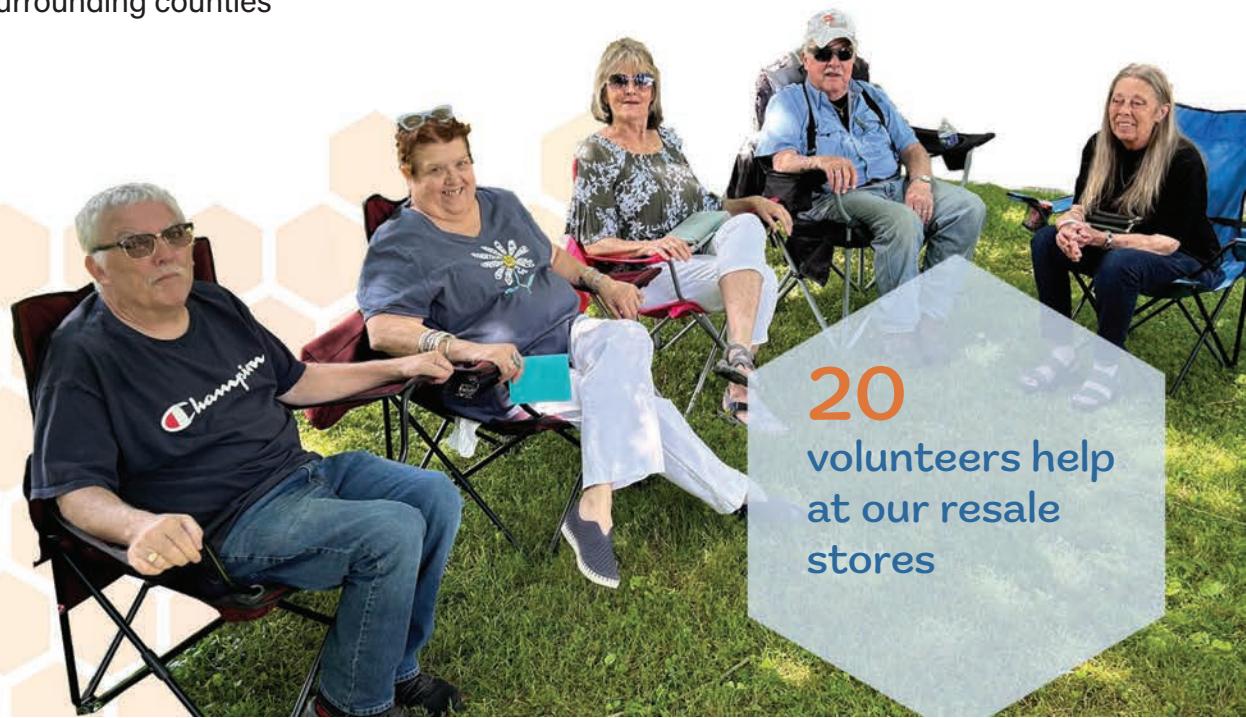
Resale store employees

Mountain Projects operates two Resale Stores, in Sylva and Waynesville. Both stores accept donations of lightly used, clean clothing, shoes, and housewares.