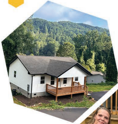
Harris Estates, Sylva – three new homeowners