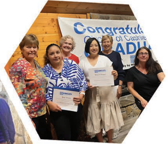
Circles volunteers and participants, above, and Hands on Jackson volunteers, left