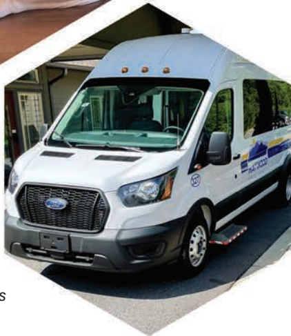
Haywood Transit bus drivers provide clients with safe access to transportation