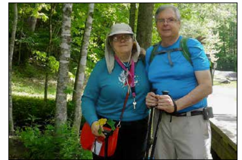
From hiking trips to shopping excursions to training and insurance counseling, the Senior Resource Center keeps a full calendar!