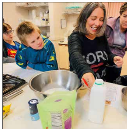
Circles of Cashiers-Glenville hosted two cooking classes in conjunction with the Uncomplicated Kitchen and Big Brothers Big Sisters of Cashiers-Highlands

Grantor: Community Foundation of WNC Circles collaborates with Uncomplicated Kitchen, Big Brothers Big Sister of Cashiers-Highlands, Friendship Center in Cashiers, Rolling Start, First Presbyterian Church of Sylva