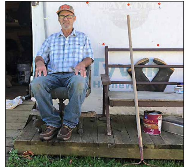
Volunteers and staff work together to build ramps and make repairs that keep homes safe and livable for disadvantaged neighbors