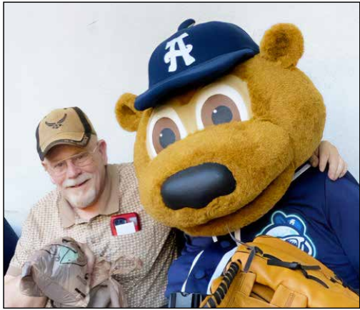
Asheville Tourists baseball!