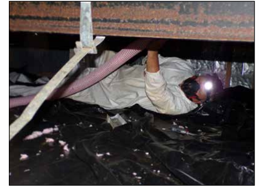
Repairing and replacing HVAC, plumbing and flooring often require working in tight, dark spaces!