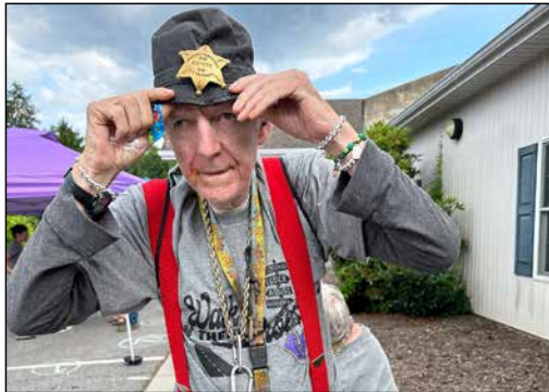
A visitor in support of Elder Abuse Awareness