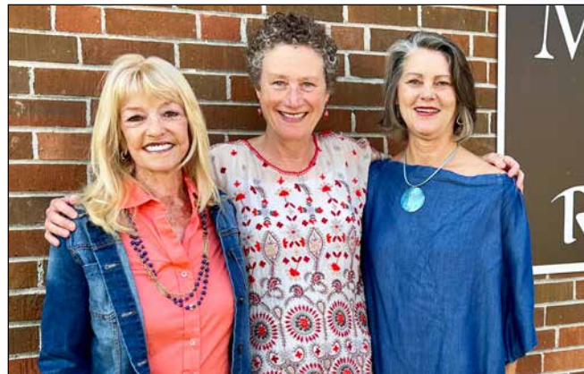
Volunteers make our resale stores go!

Income generated from the sale of donated merchandise is used to pay off operational expenses, sales taxes, and the cost of minimal paid staff and many volunteers. After expenses, the remaining revenue is used on our charitable efforts, including Mountain Projects' unrestricted emergency fund that allows our agency to assist individuals in the community with challenges that aren't covered by grant funding.