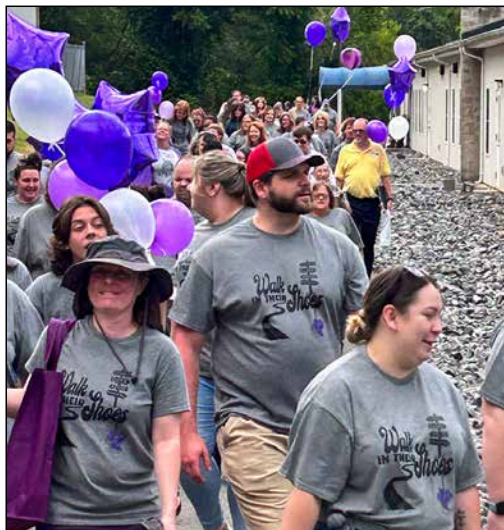
"Walking in Their Shoes" for elder abuse awareness