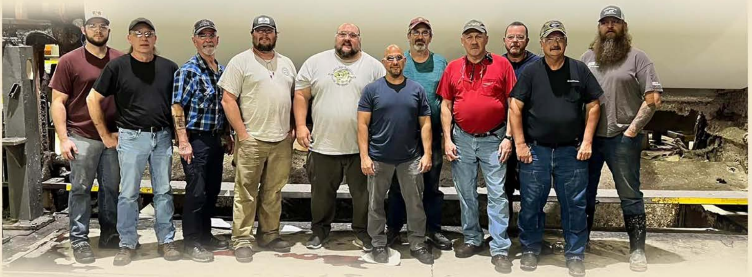
19 Machine, M Shift, Pactiv Evergreen Canton Mill